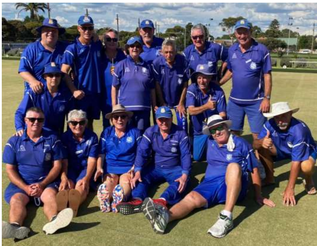
Sectional Final DIV 3 played against Hampton RSL 85-60

For some players it was their third grand final win for the club. A very important goal was achieved that will help pave the way for more success at Moorabbin.