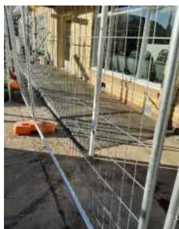
wheelchair access ramp being installed