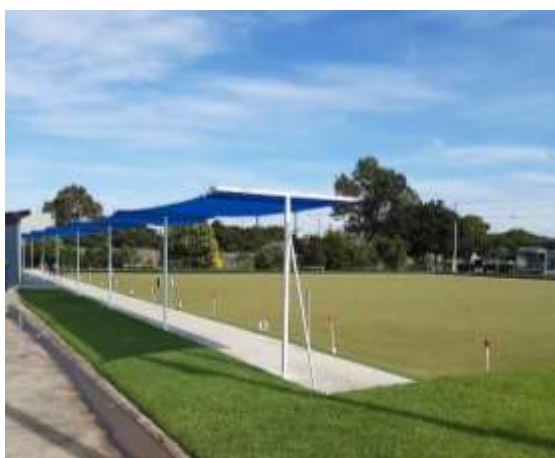
new shade installed on all greens